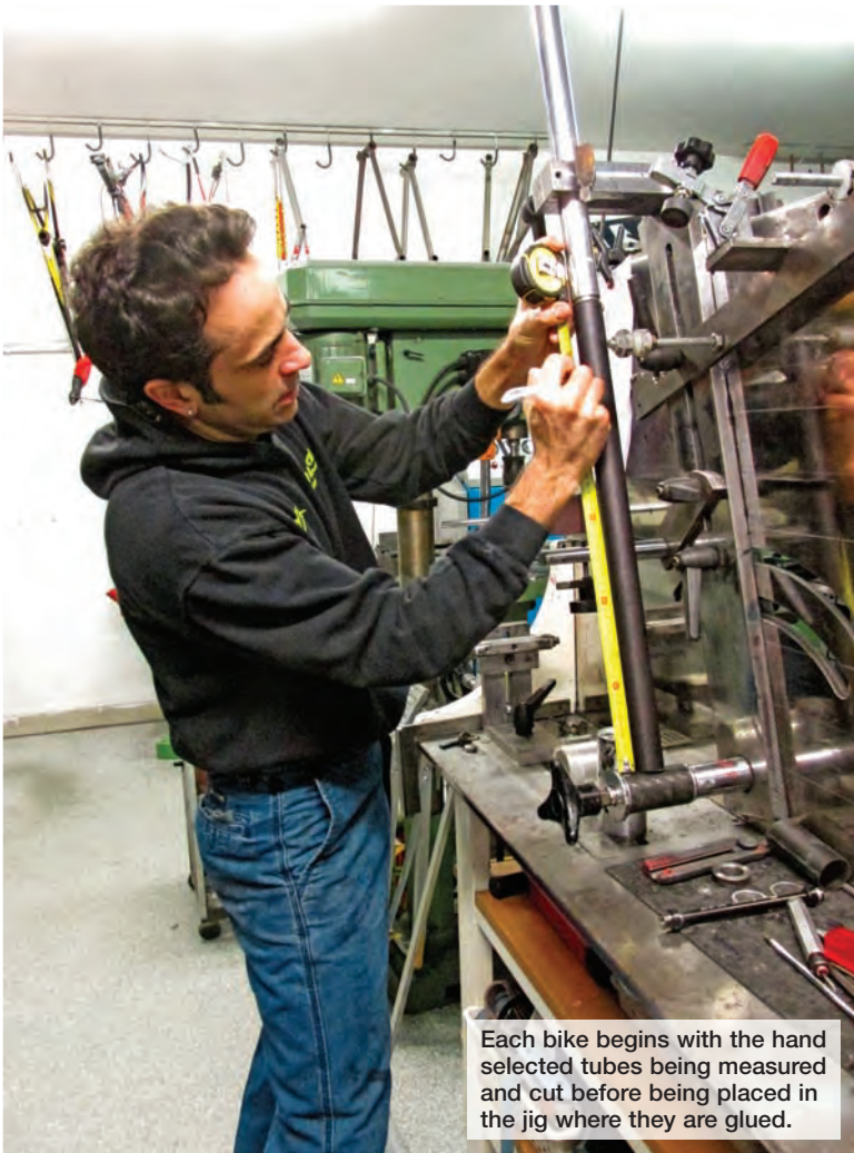
Each bike begins with the hand selected tubes being measured and cut before being placed in the jig where they are glued.