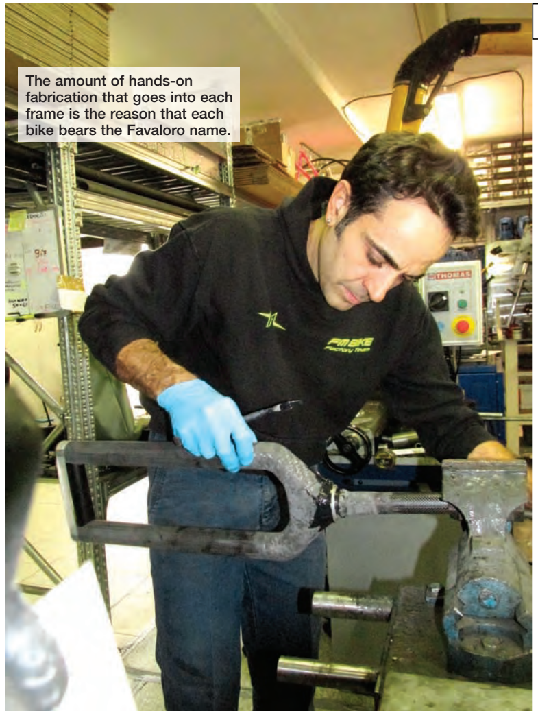
The amount of hands-on fabrication that goes into each frame is the reason that each bike bears the Favaloro name.